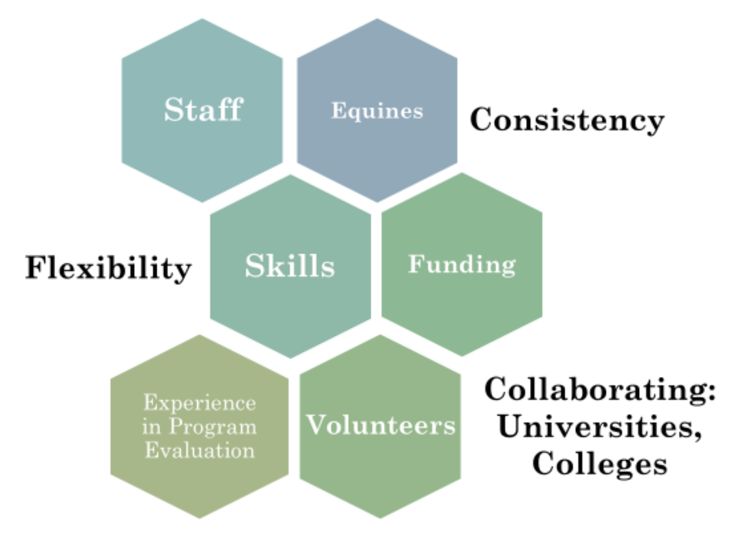
Do You Have Enough?